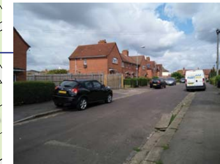
RUTHVEN ROAD ENTRANCE LOOKING NORTH-WEST