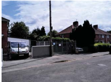
MORPETH ROAD GATED ACCESS