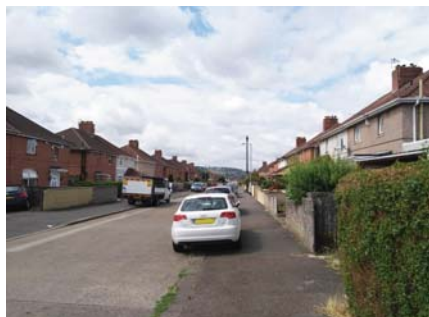
WALLINGFORD ROAD LOOKING WEST