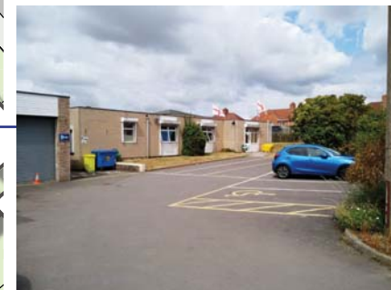
DAY CENTRE AND WORKSHOPS