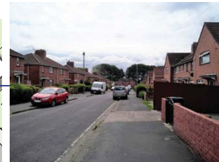
RUTHVEN ROAD LOOKING SOUTH