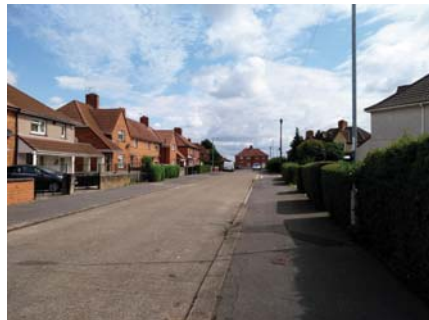
CHEPSTOW ROAD LOOKING EAST TOWARDS RUTHVEN ROAD JUNCTION