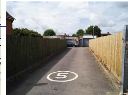
RUTHVEN ROAD MAIN ACCESS LOOKING INTO SITE