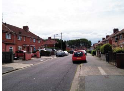
MORPETH ROAD LOOKING SOUTH TOWARDS GATED ENTRANCE (BEHIND WHITE CAR)