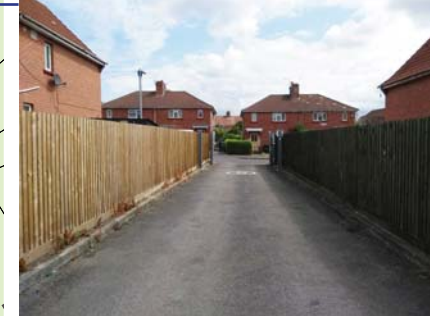
LOOKING ALONG MAIN ENTRANCE TOWARDS RUTHVEN ROAD