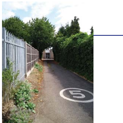
LOOKING THROUGH GATE ON MORPETH ROAD GATED ACCESS